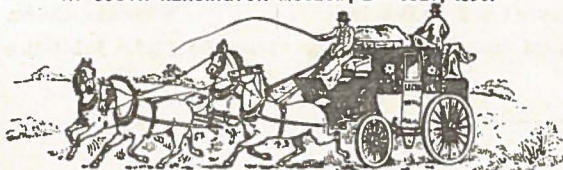
THE NORTH MAIL MAKING FOR HIGHGATE, 1790, AT 8 MILES AN HOUR.

AT SOUTH KENSINGTON MUSEUM, 2ND JULY, 1890.