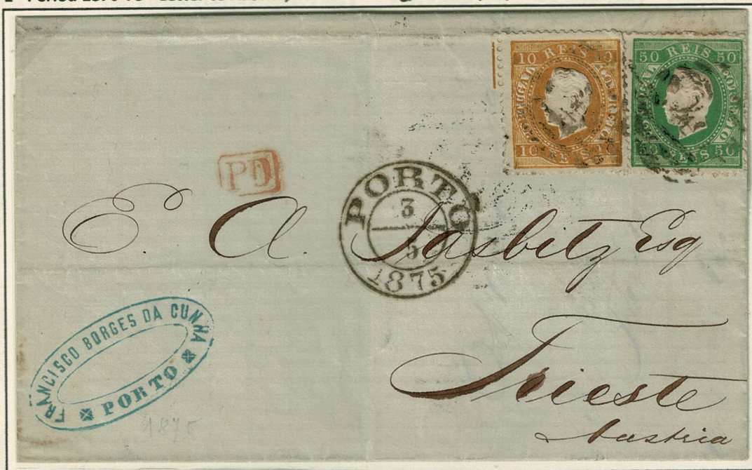
From Porto to Trieste, franked with 10 réis, yellow, 50 réis, green, both in unsurfaced paper, perforated 12 3 / 4 , die I, obliterated with oval bar postmark "46" Oporto and dated circular from origin 03/05/1875. On the back dated oval arrived postmark 11/05/1875. In red P.D. (paid to destination).

1 st Period 1870-75 - Letter to Austria, 60 réis for 15 g, from 01/10/1873 to 30/06/1875.