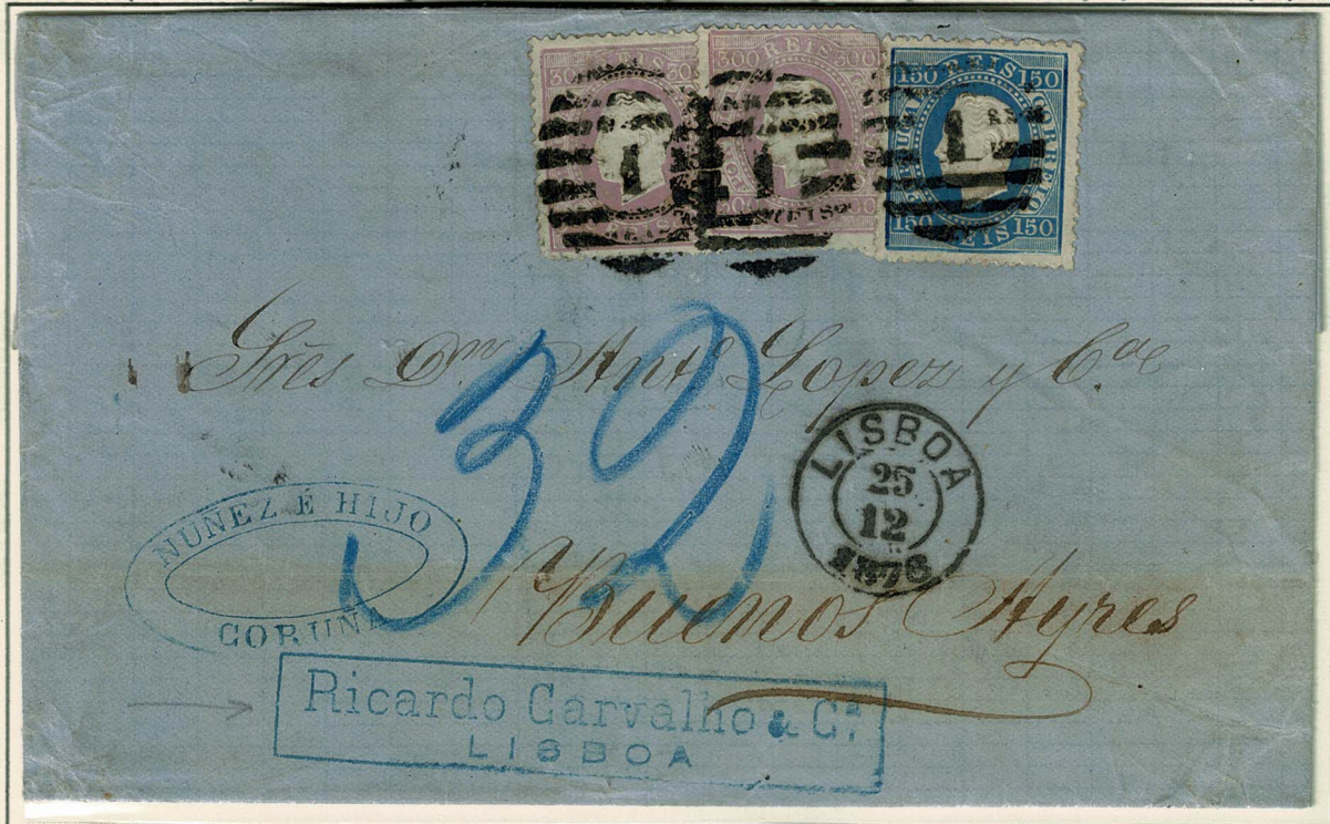
From Coruna to Lisbon carried by hand and in Lisbon sent by mail to Buenos Ayres, franked with 150 réis, blue, and two stamps 300 réis, lilac, all in unsurfaced paper, perforated 12 \frac{3}{4} , obliterated with oval bar postmark "1" Lisbon and dated circular from origin 25/12/1876. On the back circular postmark dated arrival in Buenos Ayres 18/01/1877.

2 nd Period (after 1875) - Letter to Argentina, 750 réis for 50 g, 5 th rate, by British packets from 01/07/1876 to 30/06/1877.