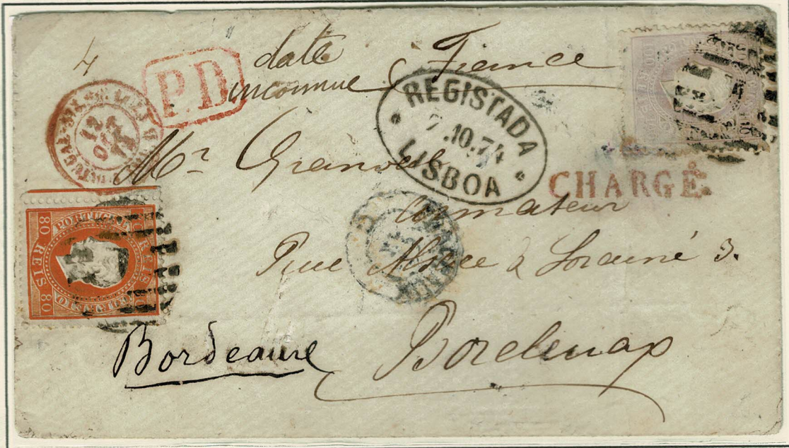
From Lisbon to Bordeaux, franked with 80 réis, orange, perforated 14, and 100 réis, lilac perforated 12 3 / 4 , both in unsurfaced paper, obliterated with oval bar postmark "1" Lisbon, and dated oval "REGISTADA" from origin 07/10/1874. Circular railway "PORTUGAL-St JEAN de LUZ". In red P.D. (paid to destination) and CHARGÉ .

Letter to France, 180 réis (80 réis for 10 g + 100 réis registration fee from 01/09/1866 to 31/12/1875).