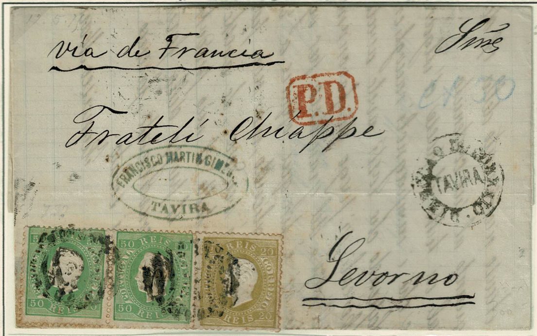
From Tavira to Livorno, franked with 20 réis, bistre and two stamps of 50 réis, green, all in unsurfaced paper, perforated 12 \frac{3}{4} , die I, obliterated with oval bar postmark "218" Tavira. In red P.D. (paid to destination). Nominative postmark "TAVIRA"

1 st Period 1870-75 - Letter to Italy, 120 réis for 10 g, from 01/10/1871 to 31/12/1875.