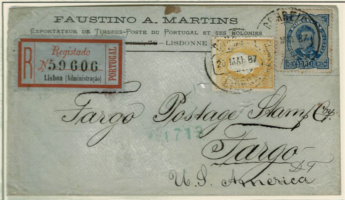
From Lisbon to Fargo, franked with 50 réis, blue, and 150 réis, yellow, chalky paper, perforated 13 3 / 4 , die II, obliterated with dated circular from origin 20/03/1887. On the back arrived dated oval from New York 06/04/1887.

Letter to USA, 200 réis ( 150 réis - 3rd rate for 45 g + 50 réis, registration fee) from 01/07/1875.