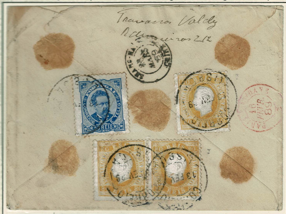
From Lisbon to Shangae, franked with 50 réis, blue and three stamps, 80 réis, orange, all in chalky paper, perforated 12 3 / 4 , die I, obliterated with dated circular postmark 13/02/1889. Arrived dated circular 23/03/1889, In the front registered label.

- Letter to China, 290 réis (240 réis 3rd rate for 45 g + 50 réis for registration fee).